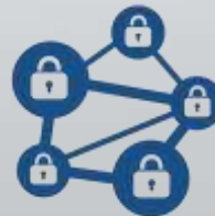
Dispatch Centres Node